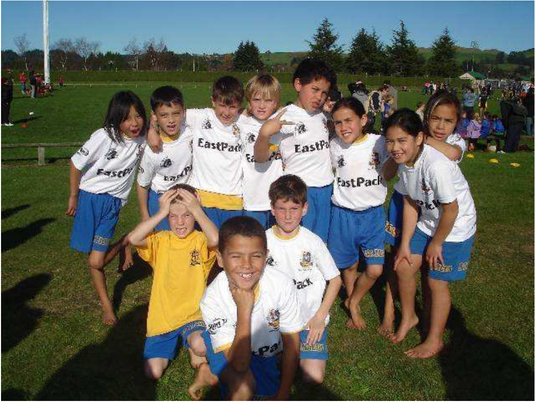
Rippa Rugby World Cup Tournament -1/6/11