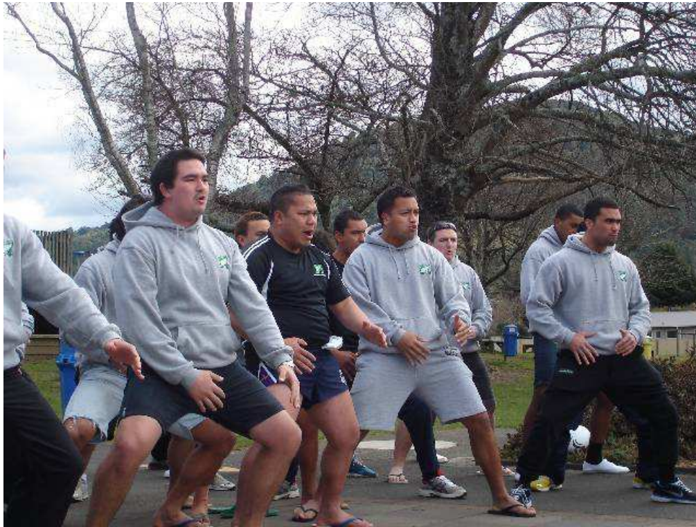
PUPILS FUN MORNING LAST WEEK WITH MARIST RUGBY PLAYERS FROM AROUND N.Z & THE ISLANDS